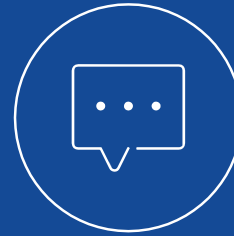
Dedicated Point of Contact