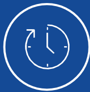
Half Hourly Metering