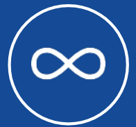
Automatic Switching Service